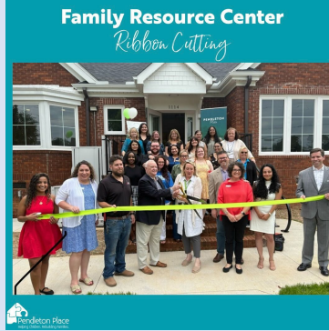
Pendleton Place staff and board members celebrate the ribbon cutting.