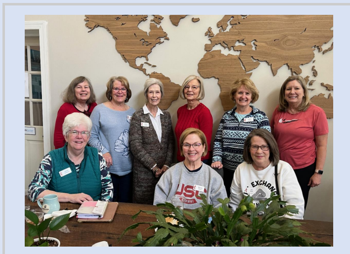
March First Friday Coffee Participants