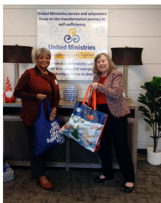
United Ministries – A